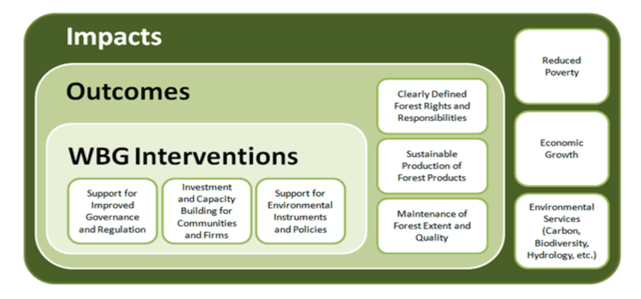
Figure 2. The Conceptual Framework for the Evaluation

30. The conceptual framework of the study (Figure 2) is based on the results chain implicit in the WBG's 2002 Forest Strategy, as interpreted by IEG.