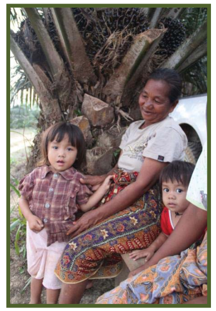
Indigenous Batin Sembilan family, Sumatra, Indonesia

Yet in many countries forest peoples do not have secure tenure over these areas and are denied access and use of their territories because of inadequate government policies, extractive industries' activities, or conservation initiatives, such as protected areas. At the same time, many indigenous territories are increasingly threatened by unsustainable activities such as logging, mining, cattle ranching and plantations. Where forest-dwelling communities lack legal recognition and where their rights are not protected by national laws, their land is vulnerable