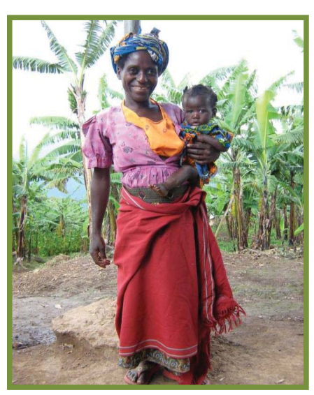
Mutwa woman and child, Kisoro District, Uganda

It is important to note that not all forest dependent peoples are necessarily indigenous peoples, although many indigenous peoples are dependent on forests and other natural resources. In South Asia, South East Asia and Africa, for example, agriculturalists have a long history of using forest produce and of regulating access to forest resources. <sup>16</sup>