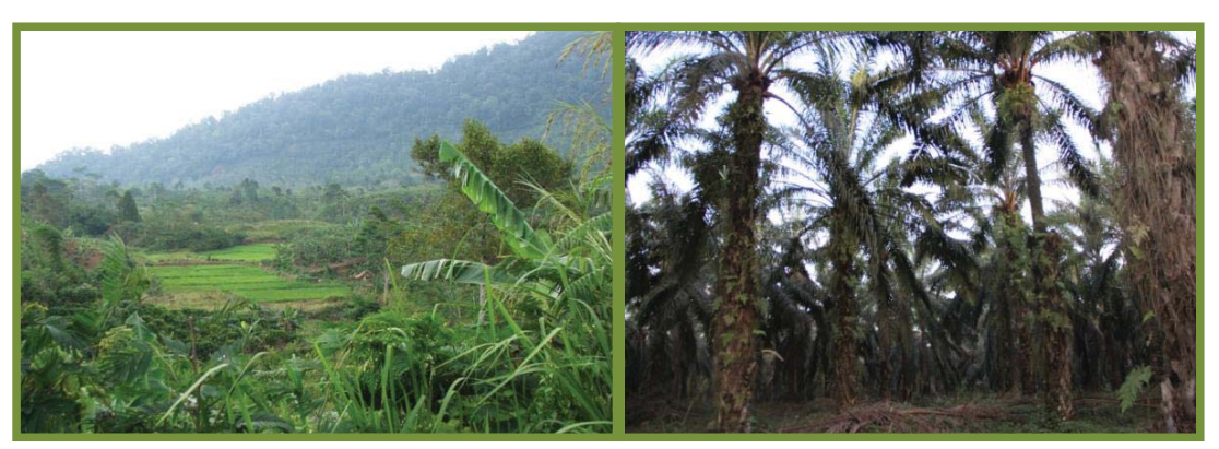
Whither the forest? Mixed rural livelihood systems, Lampung, Indonesia/Marcus Colchester Industrial oil palm plantation, Jambi, Indonesia/ Sophie Chao

Forests are also legal jurisdictions. For example, as originally conceived in Europe, a 'forest' was an area of land set aside for Royal Hunts and included any areas suitable for deer hunting, including heaths, pastures and farmland as well as woodlands. Such areas became subject to the forestry laws and denied or diminished the common people's rights to the lands. Ever since the first 'forest' was declared in England, forests have thus been contested jurisdictions. The rise of ecological theory has shifted the emphasis in the definition of forests away from this original notion towards an appreciation of 'forests' as tree-dominated ecosystems, but the idea that forests are areas of land reserved for the strategic interests of the State remains very strong.