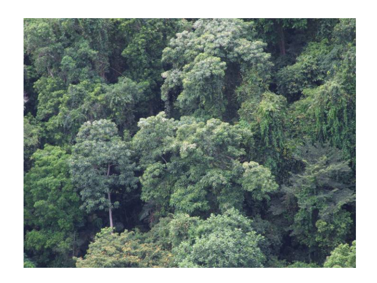
Friends of the Earth Japan/Global Environmental Forum