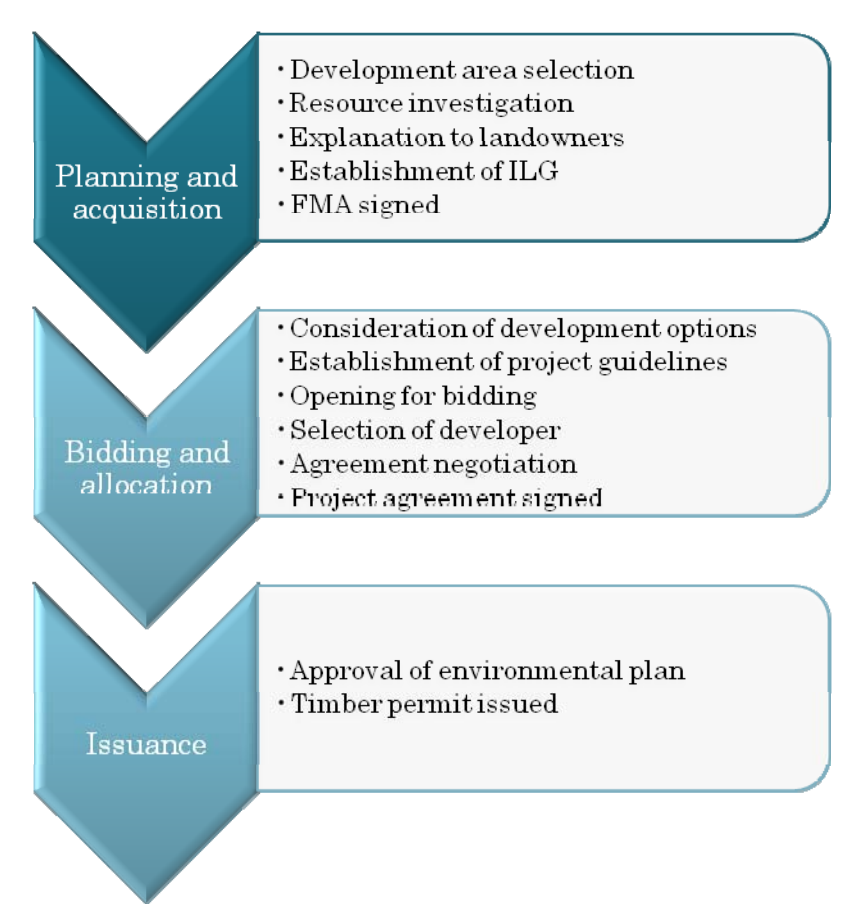
Figure 1. Major processes between the pre-development implementation stages and the issuance of TPs

The following are the points to be noted under the above series of processes.